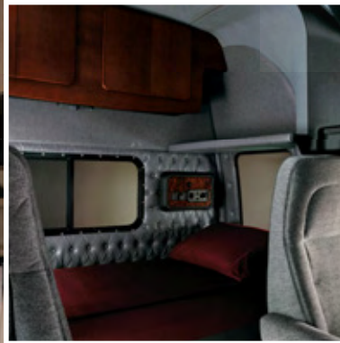
54" High Roof Stratosphere Sleeper