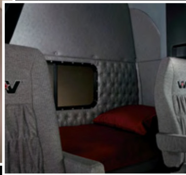
40" High Roof Stratosphere Sleeper

You logged your first million miles by the time you were thirty ... on nothing but youth and adrenalin.