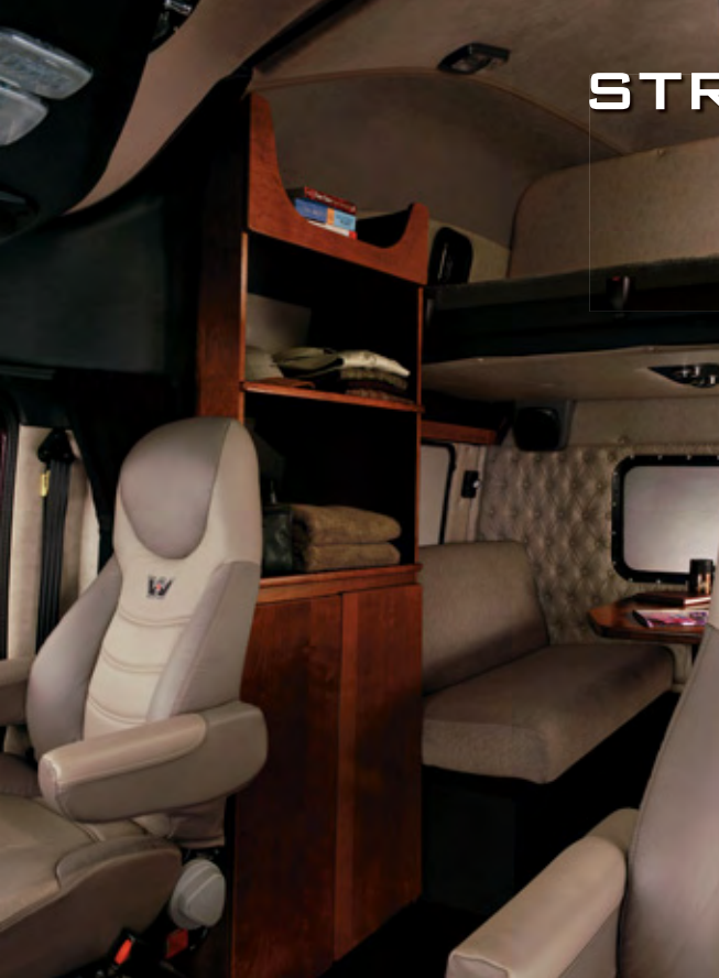
82" Ultra High Roof Stratosphere Sleeper